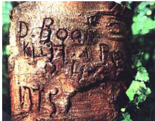
D. Boone killed a bear on this tree 1775.

Eastern Tennessee, USA, is probably best known for the Great Smoky Mountains (including the national park that bears their name), the cities of Gatlinburg (gateway to the park) and Pigeon Forge (home of Dollywood), and the University of Tennessee (go Volunteers!). Just northeast of these landmarks and attractions lies the city of Kingsport. Less than 5 miles from the Virginia border, Kingsport is home to Bays Mountain Park and Planetarium, the annual summer Fun Fest, and the Exchange Place Living History Farm, where, before it became a plantation and stagecoach horse “exchange” station, Daniel Boone, traveling along the Wilderness Trail, killed a bear and recorded the incident on a beech tree.